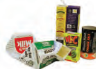
Cartons Cartones de Jugo y Leche