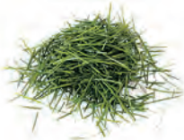
Grass Clippings & Weeds Hierba