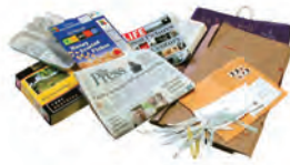
Paper & Cardboard Papel y Carton