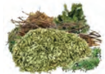
Brush & Prunings Ramas de Poda

Green waste should be loose in cart, not in plastic bags and must fit inside cart with lid closed. Place cart at curb with front of cart facing the street. Cart must be within 3 feet of the street to be serviced.