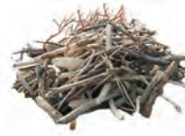
Branches - less than 4" in diameter Ramas del Árbol Pequeñas