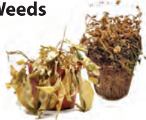
Garden & Houseplants Plantas de Exterior y Interior