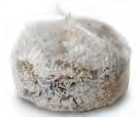
Shredded Paper Papel Molido

Recyclables should be loose in cart, not in plastic bags, except for shredded paper, and must fit inside cart with lid closed. Place cart at curb with front of cart facing the street. Cart must be within 3 feet of the street to be serviced.