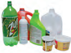
Plastic to Plásticos

ALL ITEMS EMPTY & CLEAN • TODO VACÍO Y LIMPIO