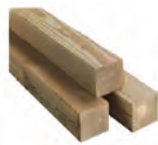
Small Lumber Untreated Madera no Tratada