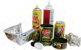
Aluminum & Household Metal Latas y Aluminio